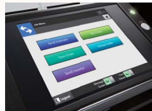
A customized Job menu

Administrators can customize the touch panel job menu and scan settings of N7100 to suit the work of a specific user or user group registered to the scanner. User's application can be integrated to the scanner as add-in software using the exclusive SDK (for Windows). N7100 comes with a USB port to connect keyboard or other USB devices *2 (except USB memory). N7100 can be customized to be a terminal exclusively for your operation.